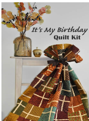
Kim Diehl fabric collection

Full punch cards must be turned in by Aug. 31 Backing coupon must be redeemed by Oct. 15 th , 2019 Double points awarded for 6 kits Loyalty points earned can be redeemed at a subsequent purchase