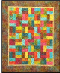
ON THE DOUBLE

Hours M-T-W-F 10-5 Th 10-8 Sat 10-4 Sun 12-4