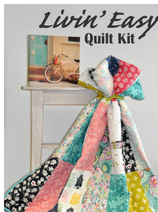
Perfect for the porch swing