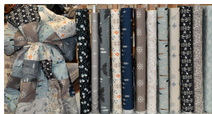
"Modern Man Cave" palette Iced Tea pattern