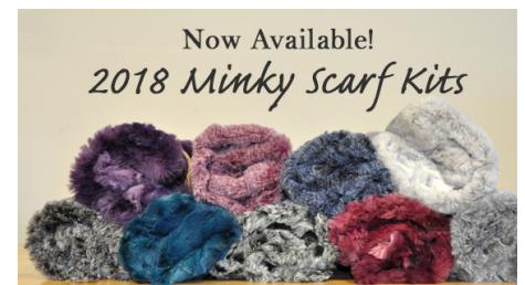
Now Available! 2018 Minky Scarf Kits