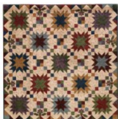
"PRAIRIE SKY" KIT FEATURING BATIK TEXTILES PRIMITIVE BATIKS ACQUILT FRIENDLY!