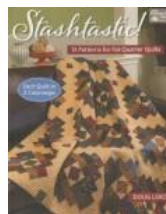
NEW BOOK BY DOUG LEKO