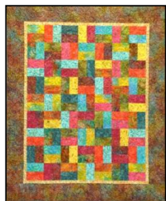
ON THE DOUBLE

Hours M-T-W-F 10-5 Th 10-8 Sat 10-4 Sun 12-4