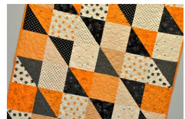
"WAVERLY" KIT FEATURING MODA "DOT-DOT-BOO!" FABRIC