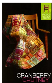
"CRANBERRY CHUTNEY" KIT 64 X 72 FUN NEW TECHNIQUE!