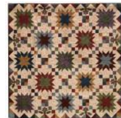
"PRAIRIE SKY" KIT FEATURING BATIK TEXTILES PRIMITIVE BATIKS ACQUILT FRIENDLY!