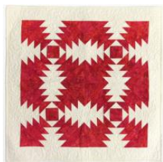
ACQUILT PINEAPPLE DIE